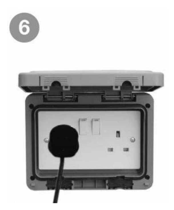
Connect the plug from the transformer to your mains outlet